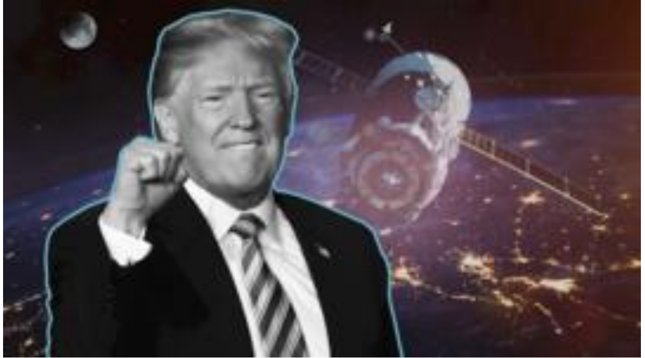
Could Trump's 'Space Force' become a reality?

BBC Future: Is mindfulness as helpful as we think?